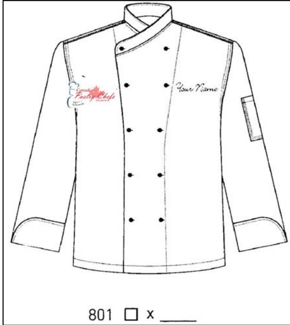
801 x _____

Please use separate form for each or style of jacket. Thank You!